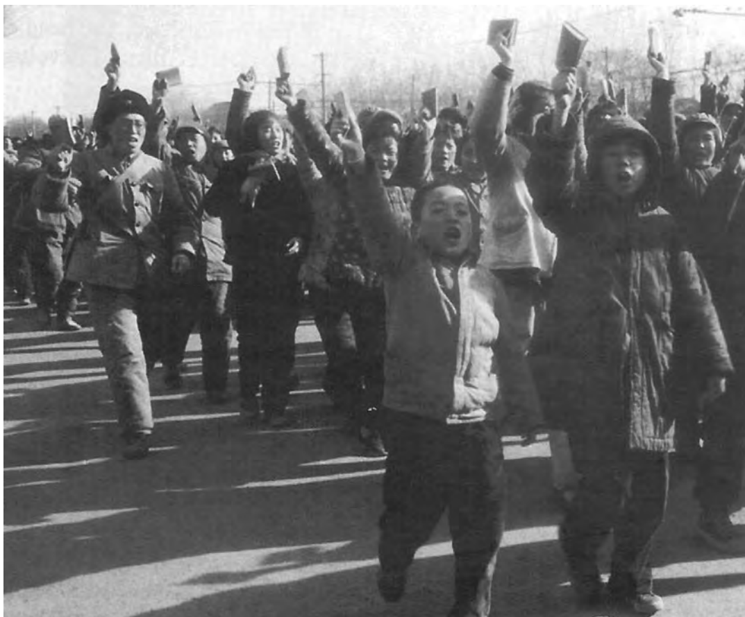
A photograph of Red Guards on the streets of Beijing during the Cultural Revolution.

16 Look at the photograph, and then answer the questions which follow.