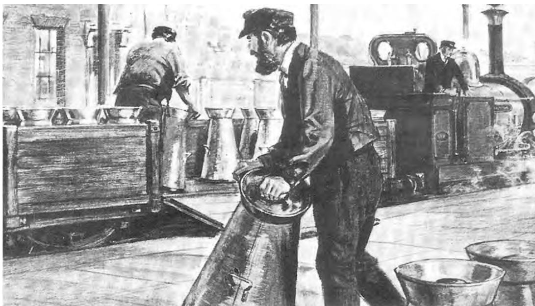
Milk churns being taken by train from farms in the west of England to the City of London.

22 Look at the illustration, and then answer the questions which follow.