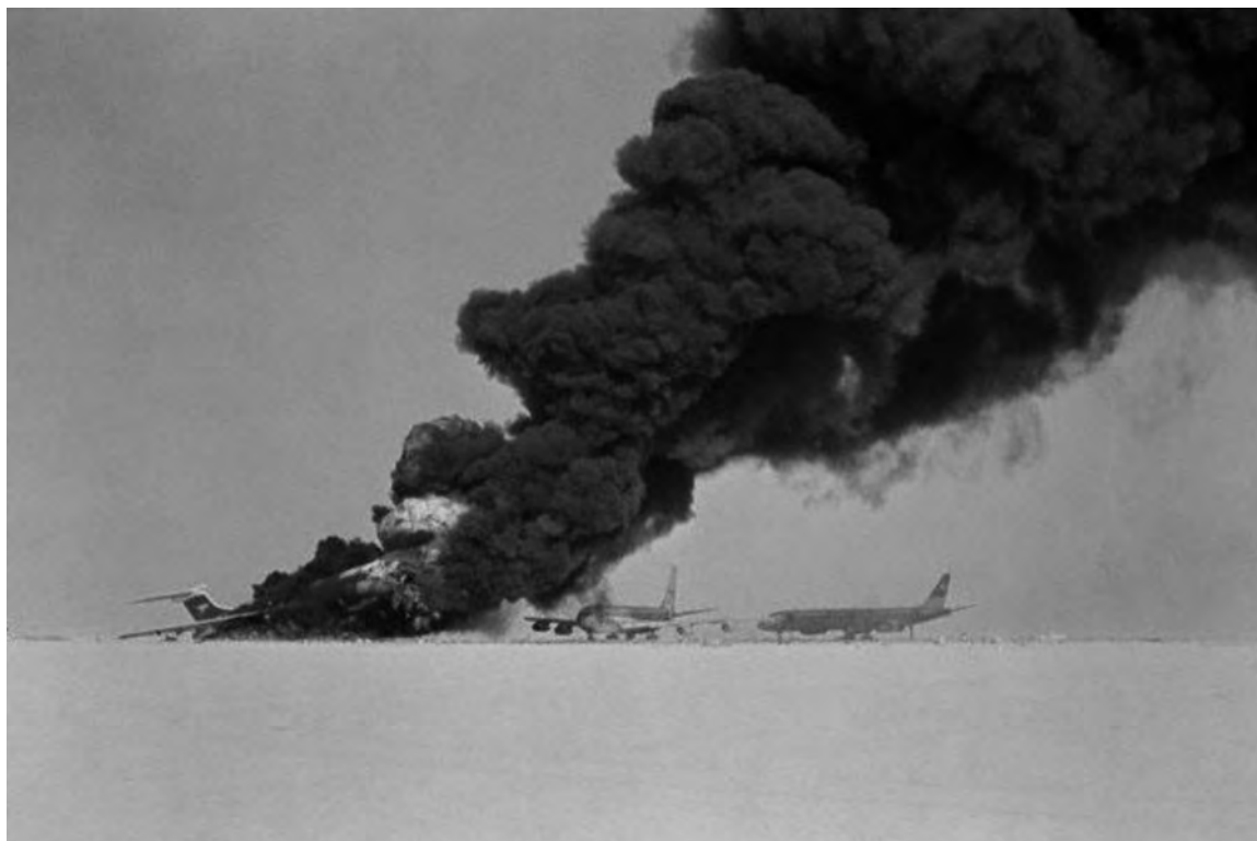
A photograph of a hijacked airliner, Jordan 1970.

21 Look at the photograph, and then answer the questions which follow.